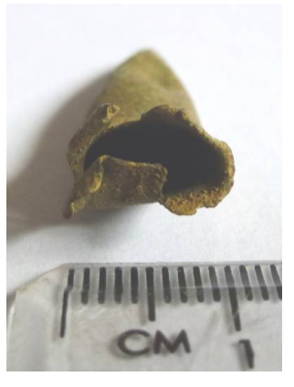
Fig 8. Bullet 5 showing hollow end.