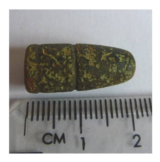
Fig 9. Bullet 6. Two recessed bands in bullet.

This bullet is exactly 9mm in diameter and 20.06mm long with two recessed bands and an indented base with white colouration within. It appears to have a copper coating in places consistent with a full metal jacket military round. It has not been possible to identify this round, which doesn't appear to be from a Sten gun or to be German 9mm Parabellum ammunition.