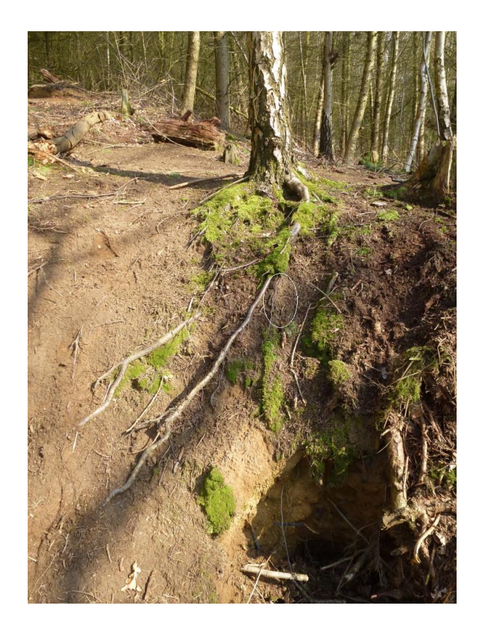
Fig 4. 27<sup>th</sup> March 2014. Find site for bullet 6 circled centre.