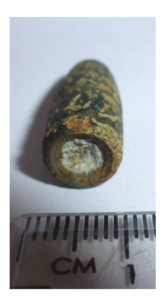
Fig 10. Base of Bullet 6 showing central white area.