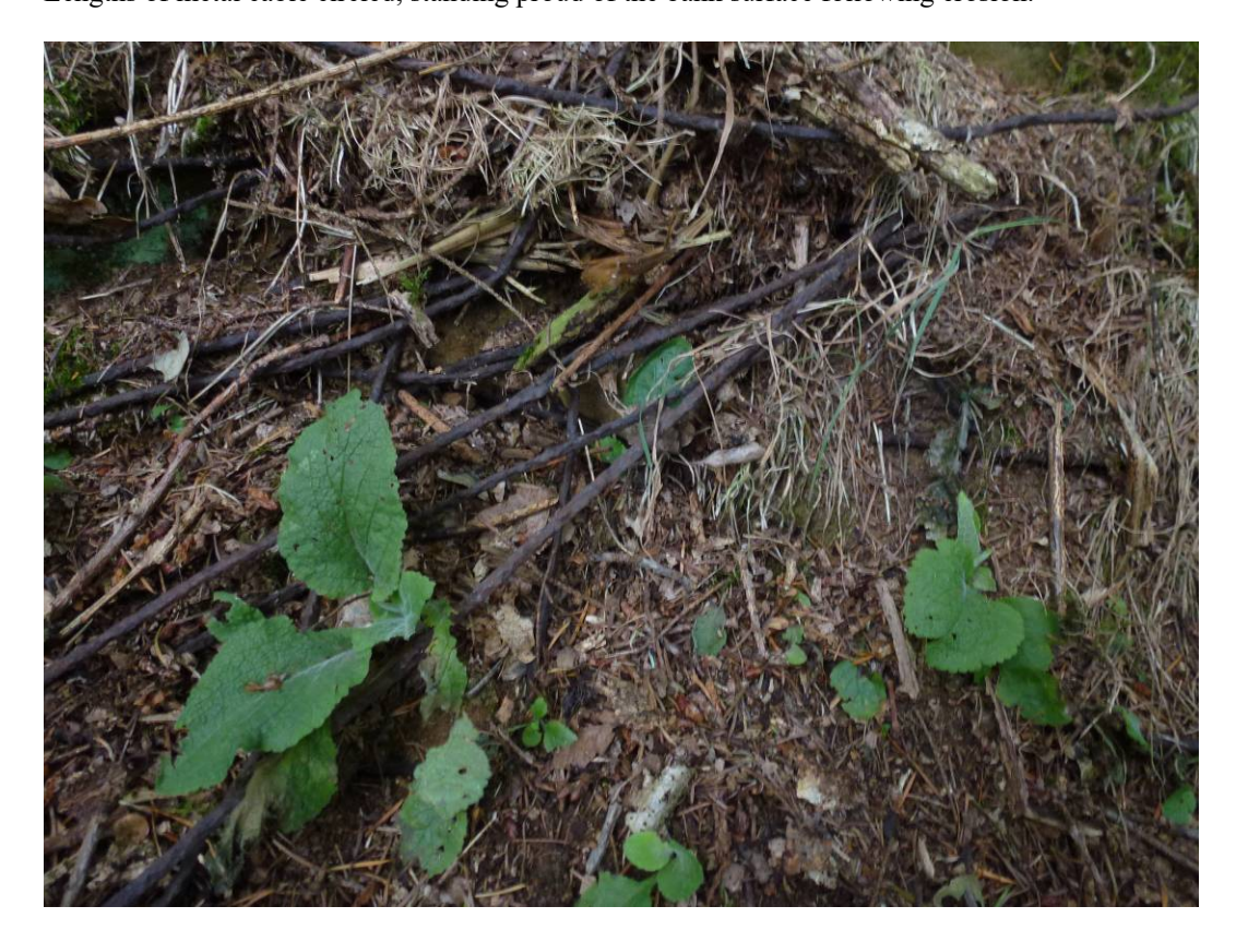
Fig\ 2. \\ 23^{rd}\ September\ 2013. Multiple strands of rusted metal cable lying parallel exposed on edge of bank.