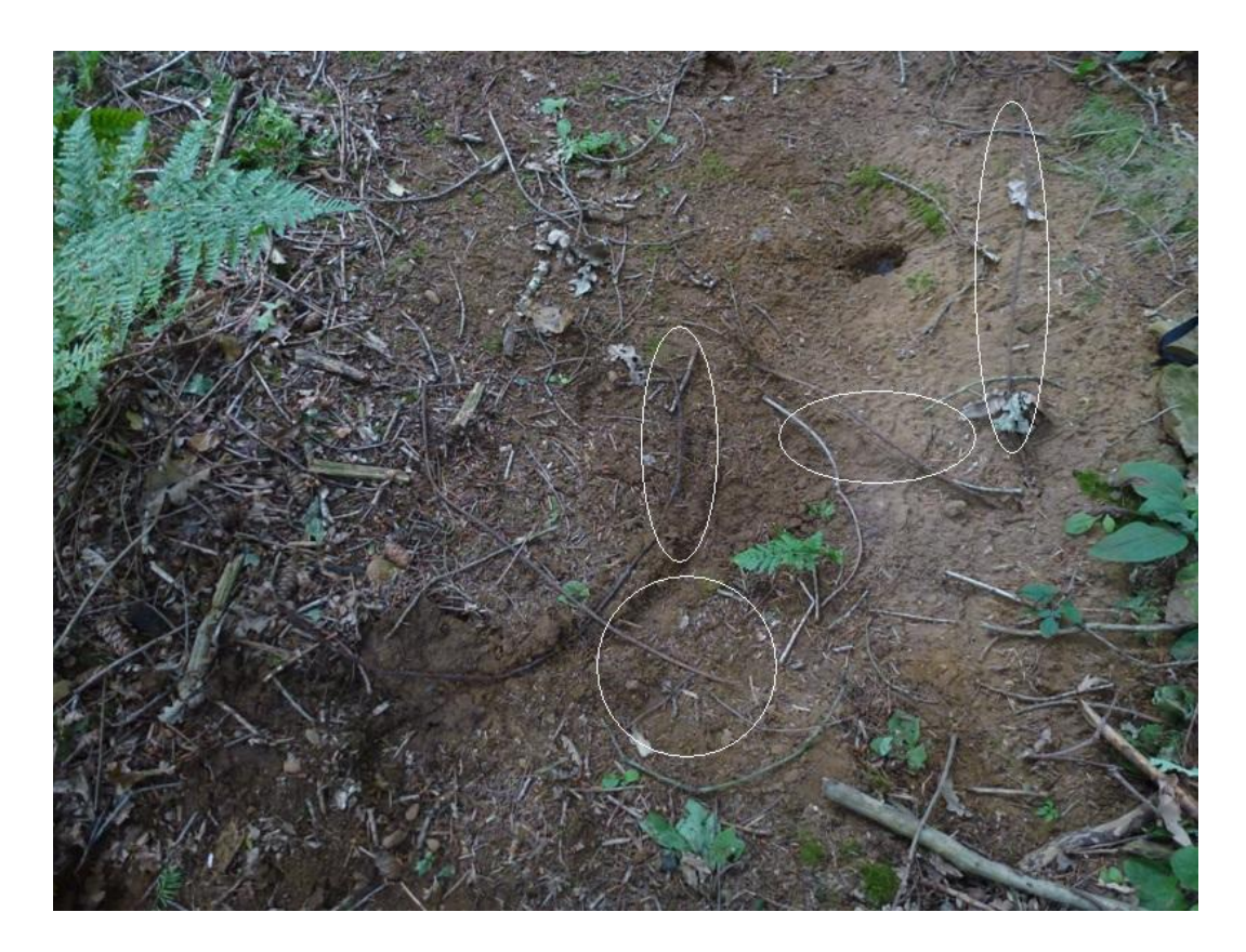
Fig 1. 23<sup>rd</sup> September 2013. Lengths of metal cable circled, standing proud of the bank surface following erosion.