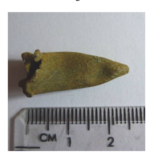
Fig 7. Bullet 5

This is the tip of a rifle bullet. It is 26mm long and 9.5 mm at its widest (flattened) diameter. It appears to be made of copper and is hollow. These features are typical of British .303 ammunition as used in rifles and other weapons such as the Bren Gun or Vickers machine gun.