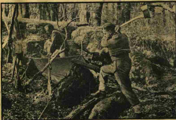
Men like these prepared secret hideouts in woods and stocked them with arms, ready for the day the Nazi invaders might have landed.

In Lincolnshire we sought out the fens, who knew every inch of their fens and marshes.