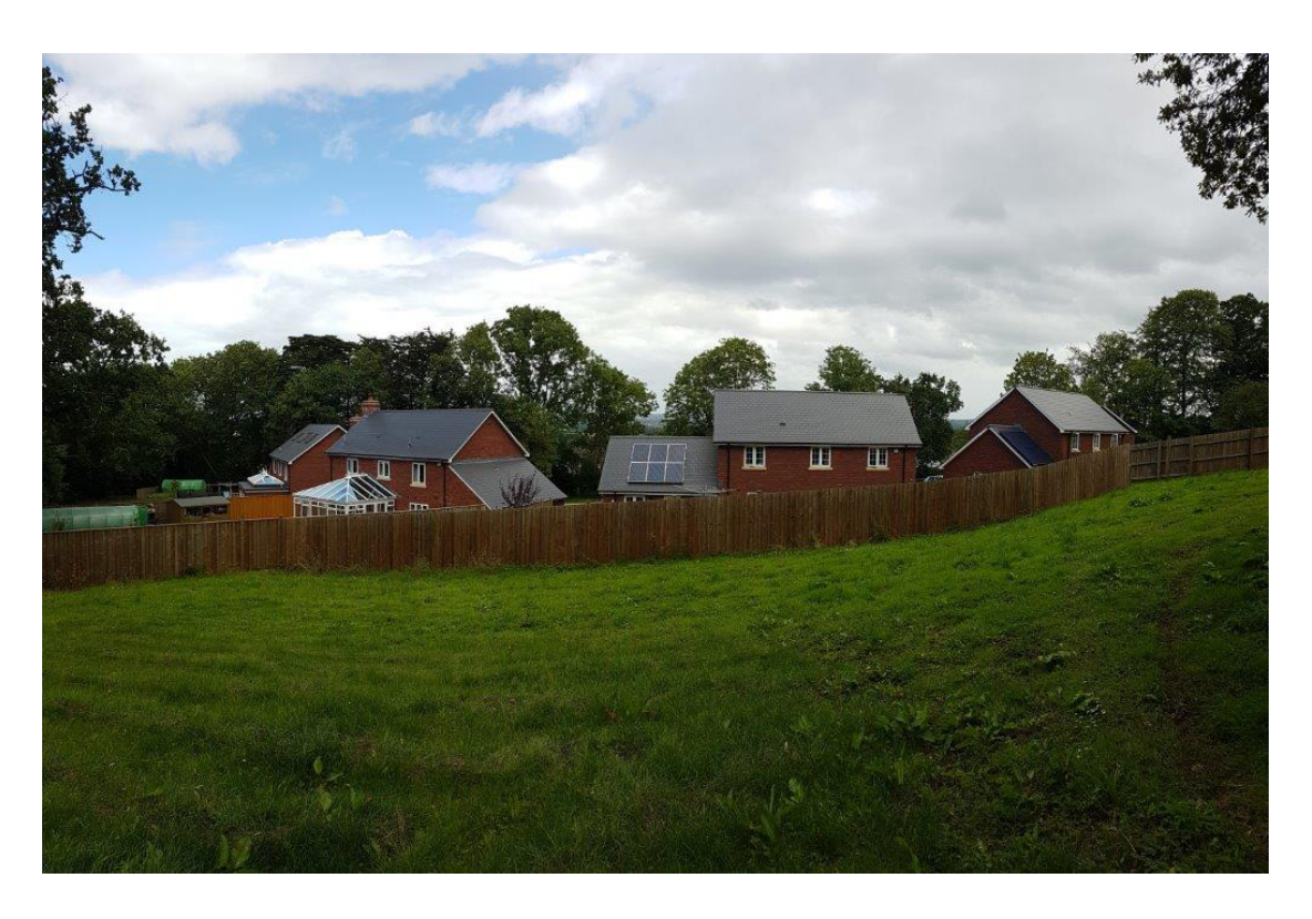
Photograph 6 – View of existing east boundary with existing development beyond.