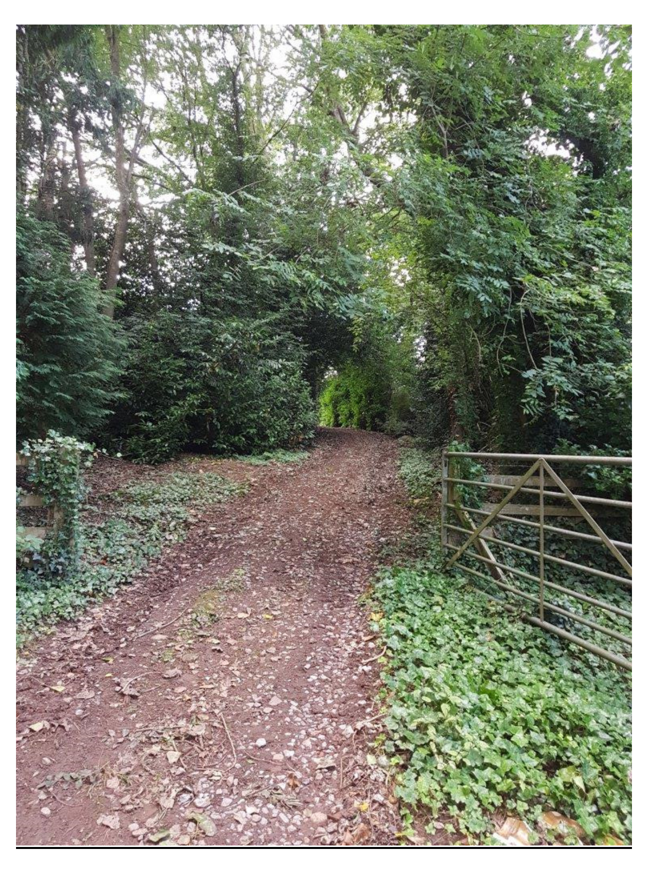
Photograph 4 – View of existing track leading from proposed site (cont.).