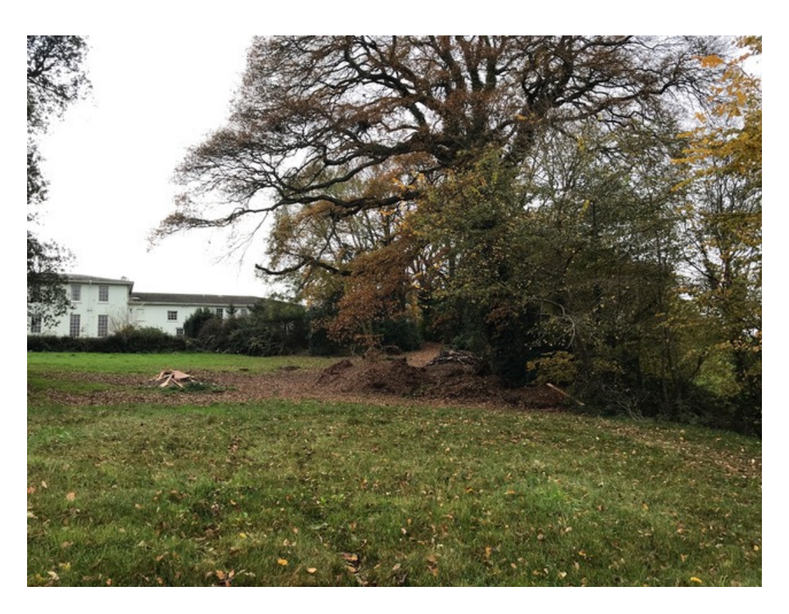
Photograph 9 – View of north boundary (cont.).