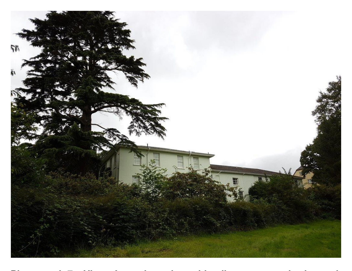
Photograph 7 – View of west boundary with adjacent properties beyond.