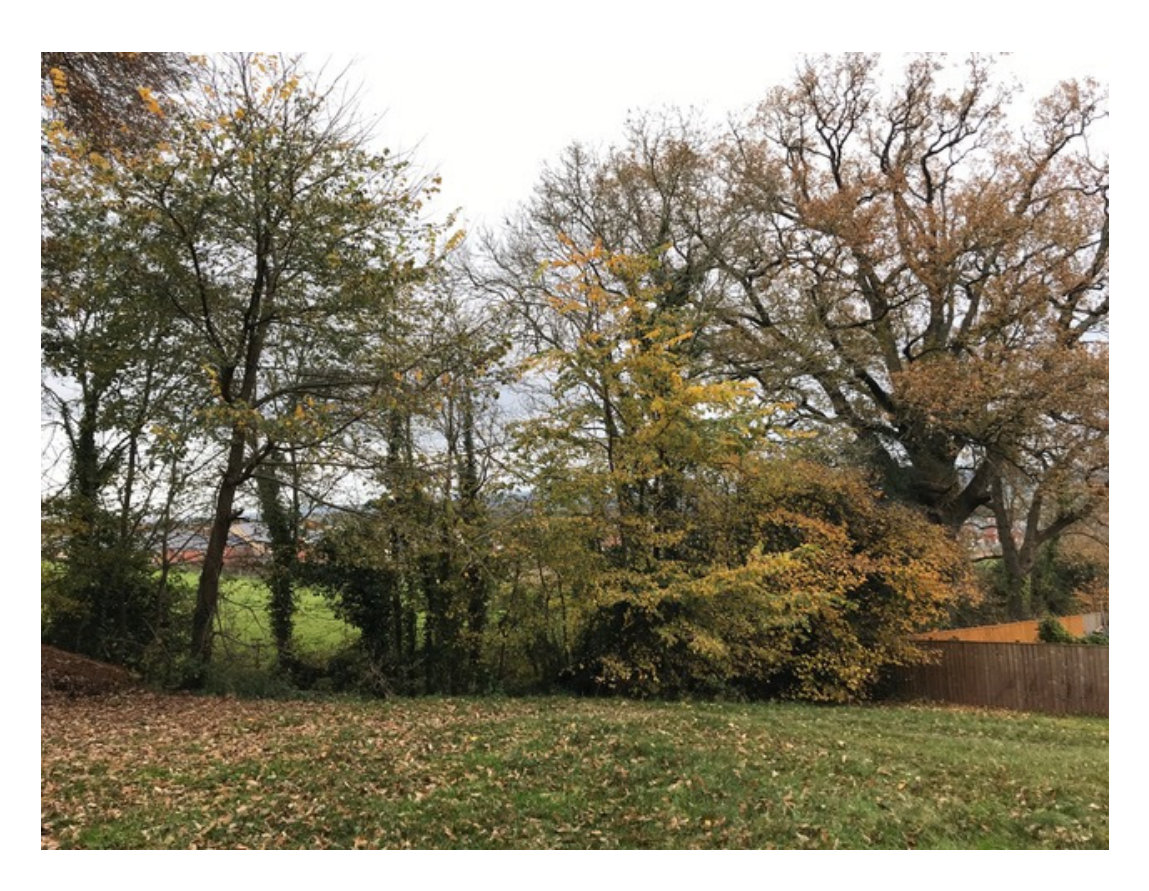
Photograph 8 – View of north boundary.