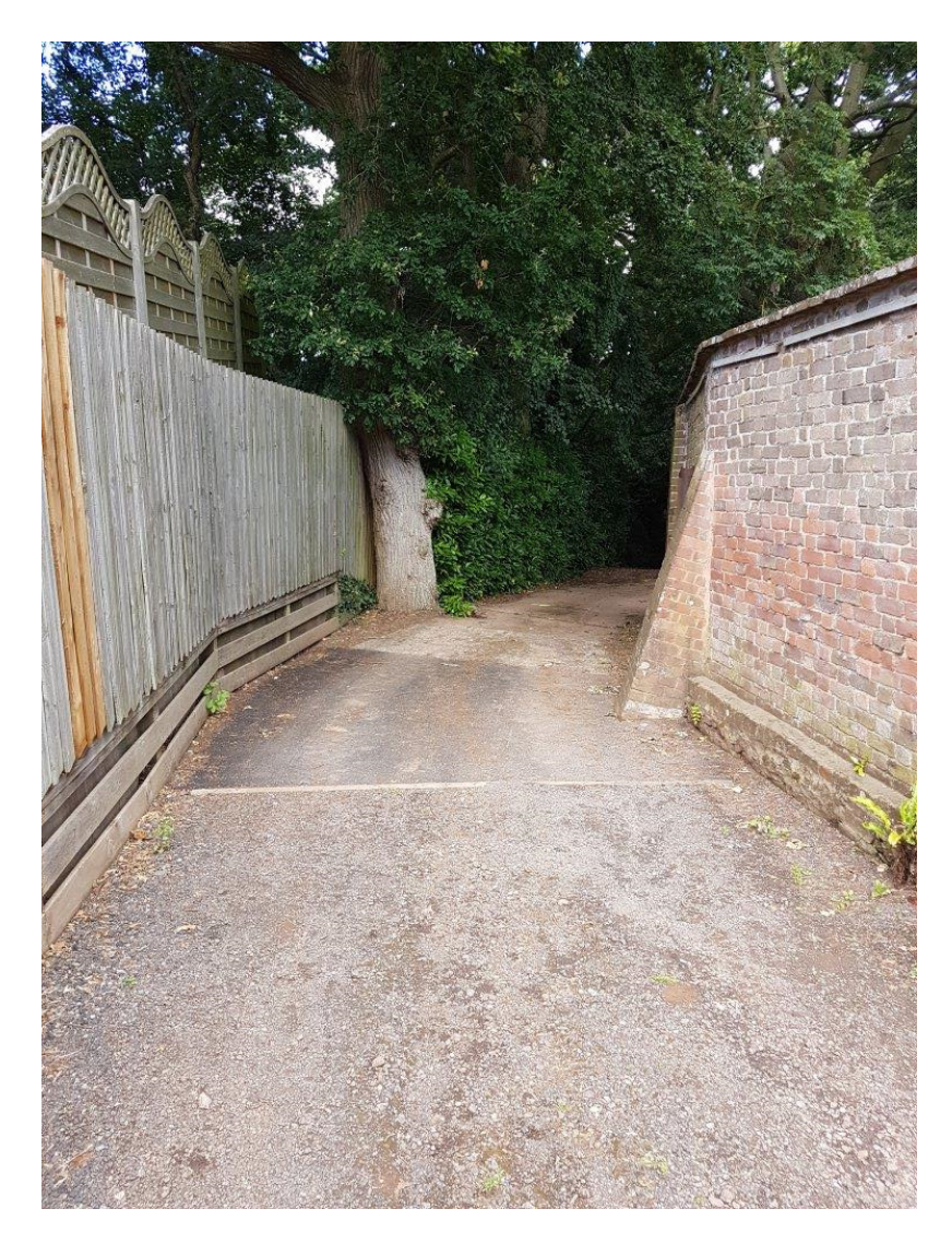
Photograph 2 – View of existing driveway leading to site.