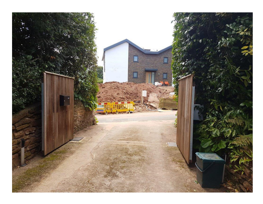
Photograph 1 – View of existing access on to Park Lane.