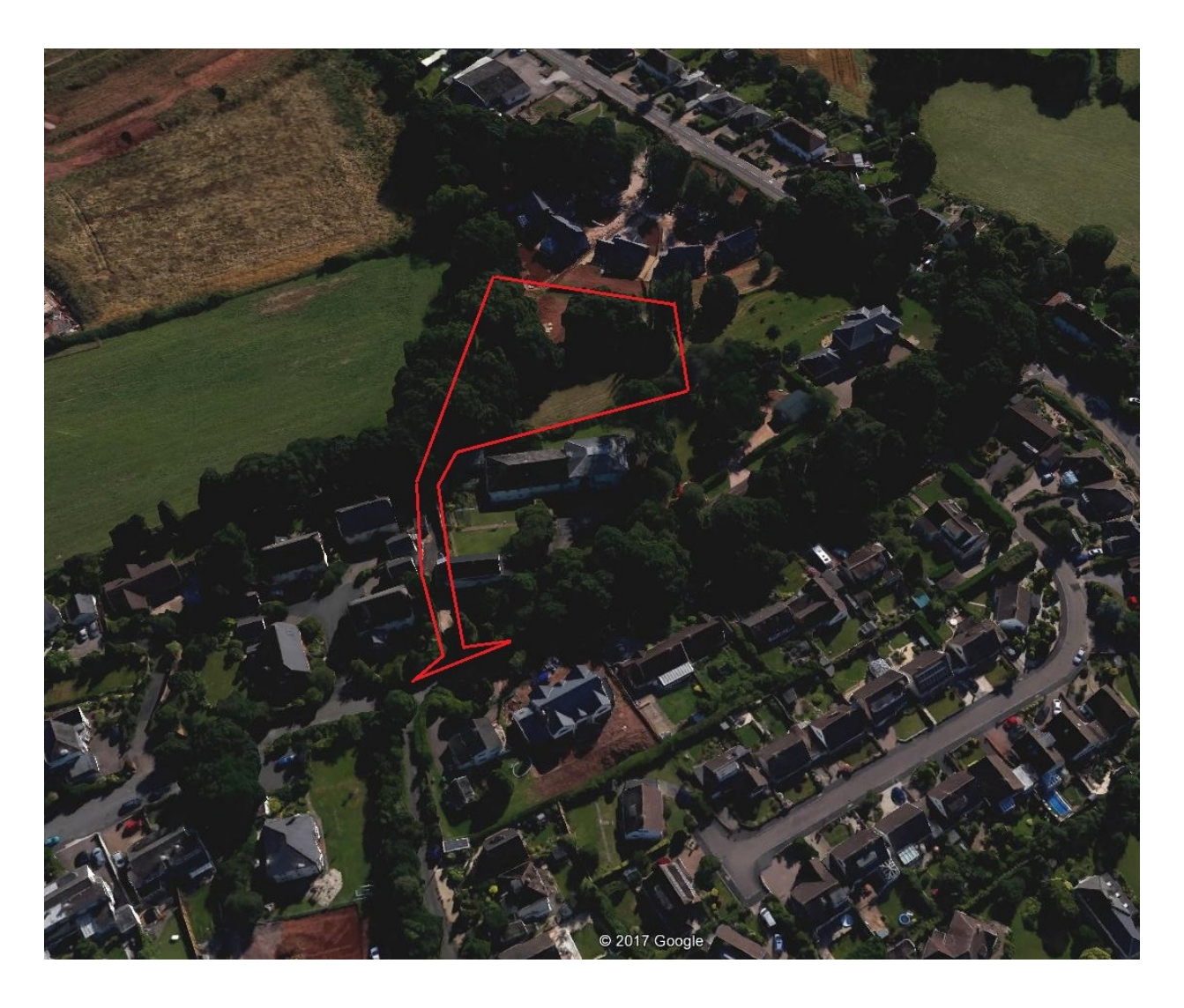
Aerial view of proposed site