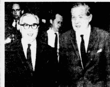
Mr. George Brown leaves with Mr. James Callaghan, the Home Secretary, after attending the Labour Party's National Executive at Transport House, London, today.

"This means it is possible the Pembroke Labour Party will break away from the Labour movement."